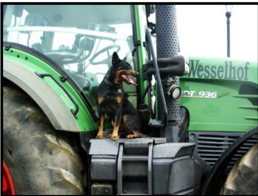
Cody, checking out the plow operations!

The club would once again like to thank Len Wesling and family for allowing us to plow their fields!